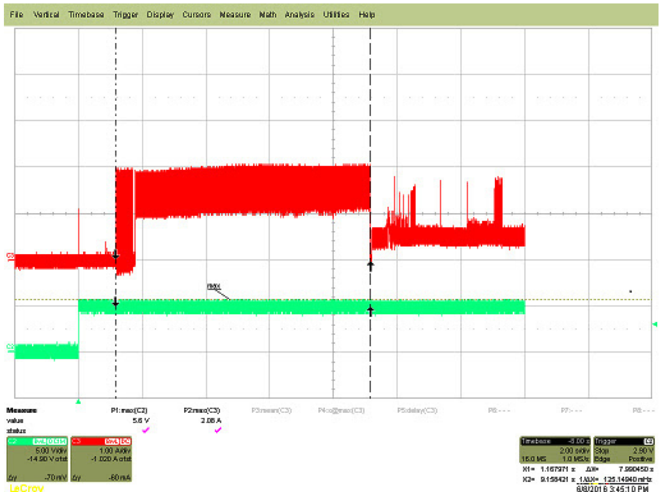
Figure 1 6TB Typical 5V and 12V startup and operation current profiles