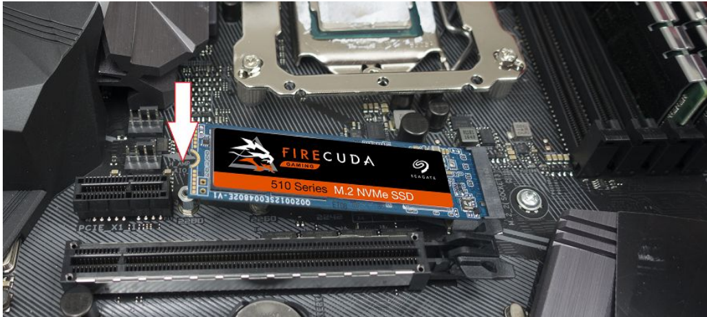
Figure 3: Seagate M.2 SSD in the M.2 Slot