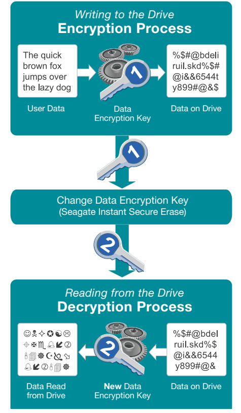
Figure 1. The Seagate Instant Secure Erase Process